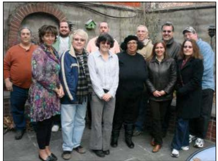
Three Week Colleague Training Group Fountain House

Visit Our New Website at highhopesclubhouse.org