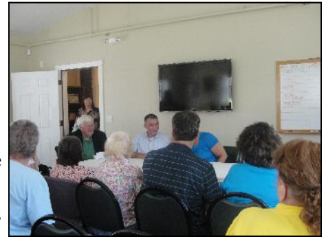
Full time employment

We are beginning to prepare our self-study for certification in March 2011 and discussed ways of getting members and staff involved in this process. The