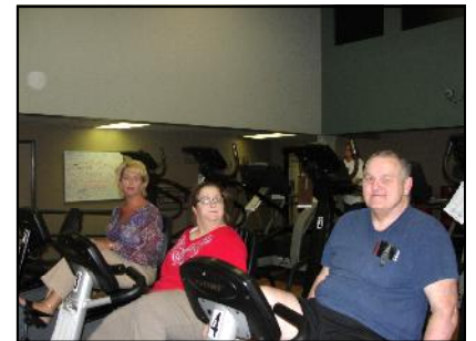
Working out at the gym

The Healthy Hearts program at High Hopes meets weekly at Champions Health and Fitness Center in Waterville. The gym membership is available to all active members and staff. This program promotes healthy lifestyles by working together to establish new habits. Each person has the opportunity to meet with a personal trainer to learn how to use the machines correctly and set up a program to meet individual needs. The gym membership is available seven days a week and members are encouraged to buddy up with a partner and have some fun.