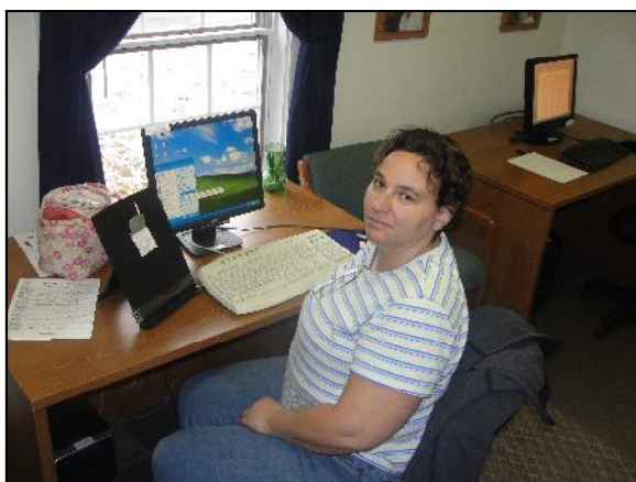
Members can use Clubhouse computers for their homework

We are open to any ideas or suggestions as to how to improve member involvement in education.