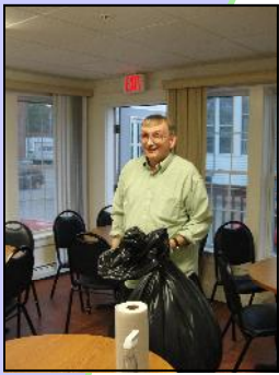
Ready for 1st annual retreat